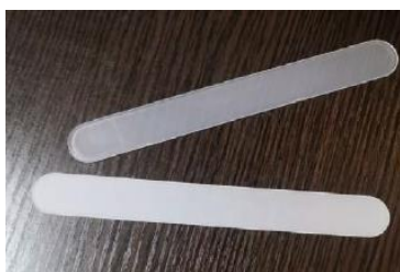
Photo 1 --- Tongue Depressor